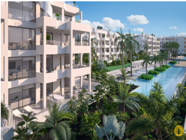
View to the complex