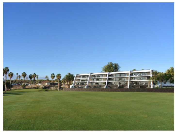
Views to the building