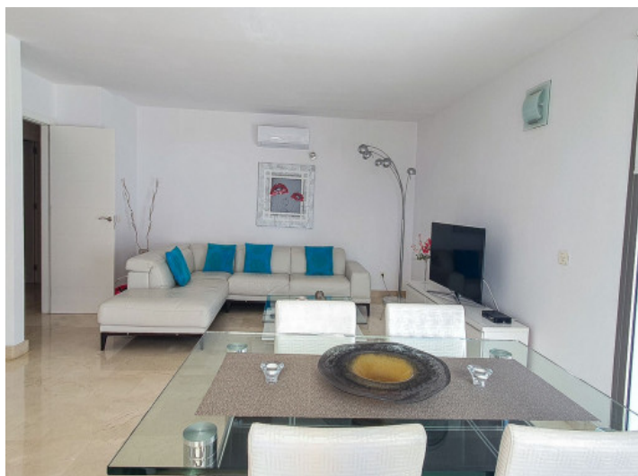
Open living and dining area