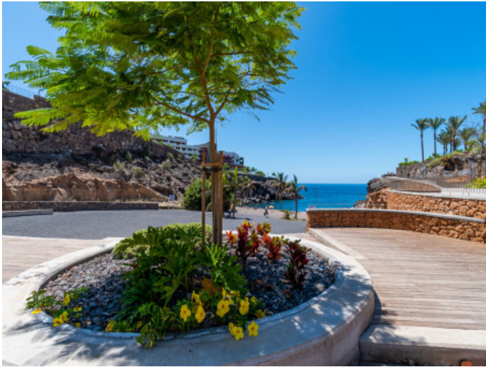
Close to the beach