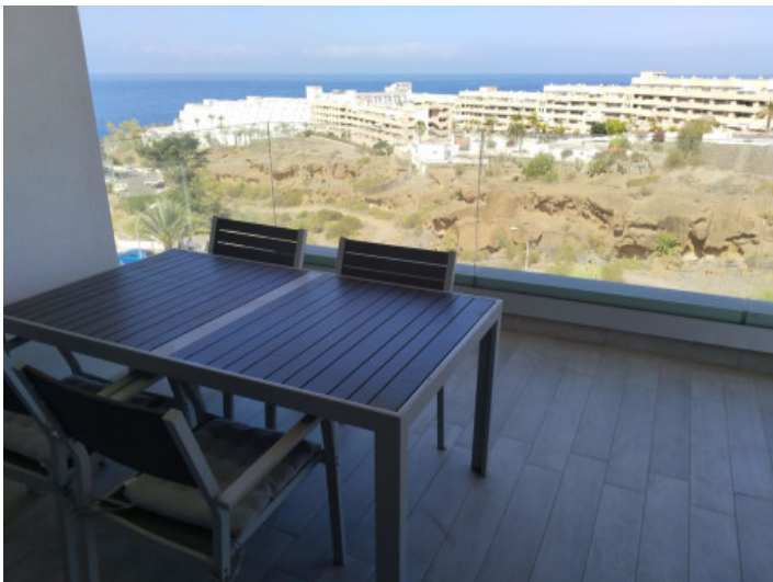
Terrace with sea views