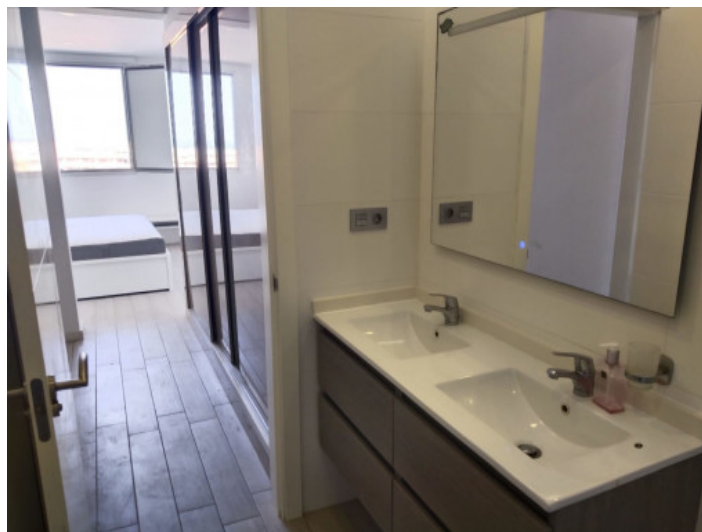
En suite bathroom