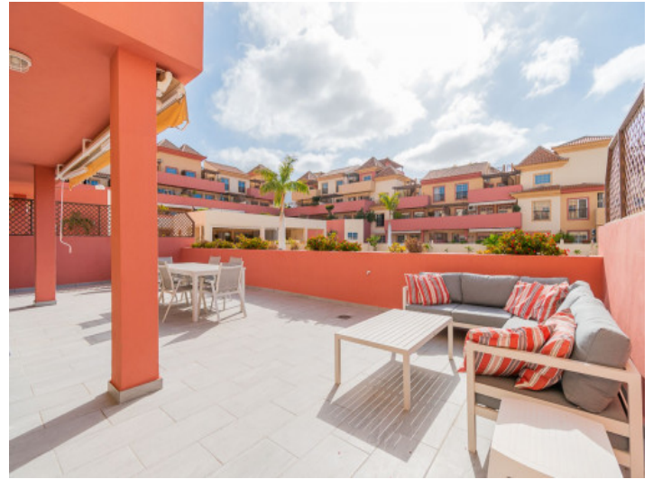
view to the community pool