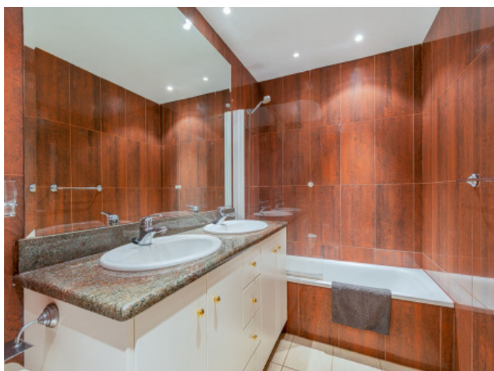
Flat with 2 bathrooms