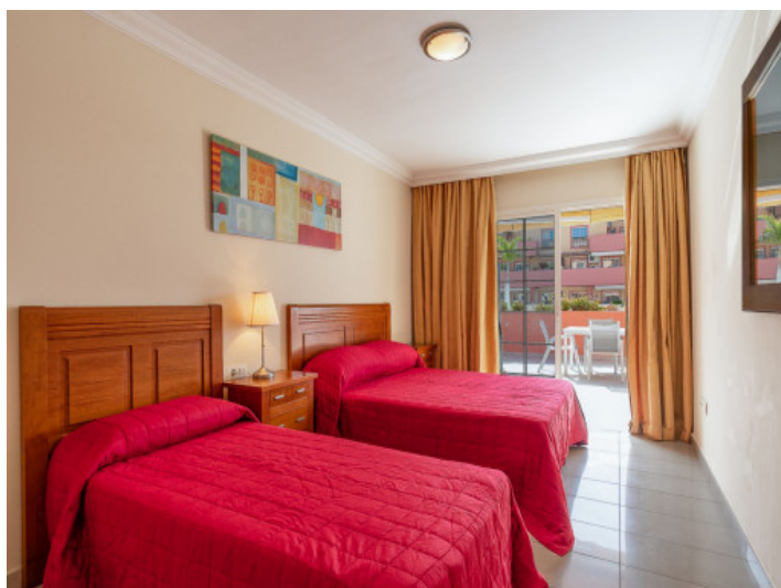
One of 2 bedrooms