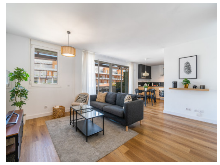
Elegant living area