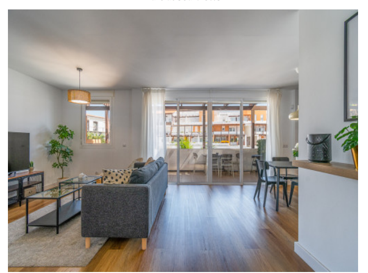
Living area with access to the terrace Dining area adjacent to the kitchen All information is correct to the best of our knowledge. Errors and prior sale excepted. This prospectus is purely for information purposes. Only the notarized deed of sale is legally binding.

PORTA TENERIFE • C./ CONQUISTADOR 8, 07001 PALMA TEL. +34 971 698 242 • INFO@PORTATENERIFE.COM