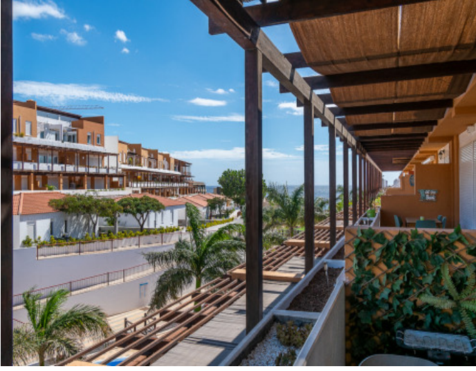
Partial sea views