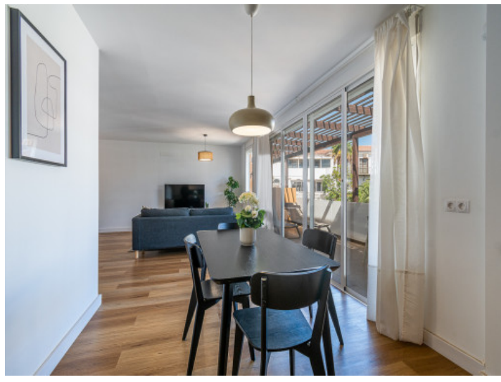
Bright dining area