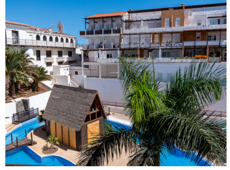
Superb communal pool