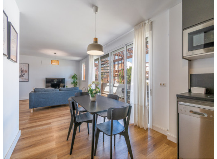
Dining area adjacent to the kitchen