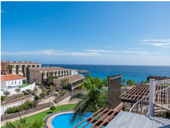
Views from the roof terrace