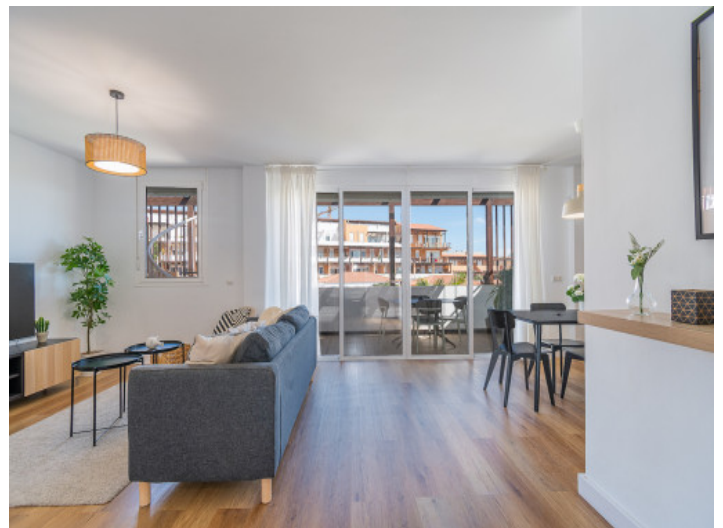
Living area with access to a terrace

All information is correct to the best of our knowledge. Errors and prior sale excepted. This prospectus is purely for information purposes. Only the notarized deed of sale is legally binding.