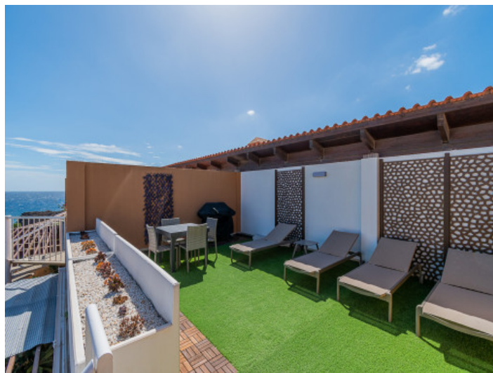
Fantastic roof terrace