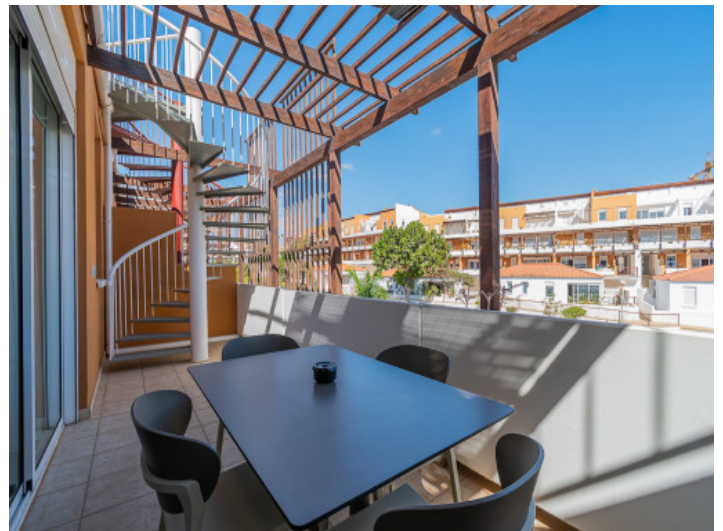
Terrace with outdoor dining area