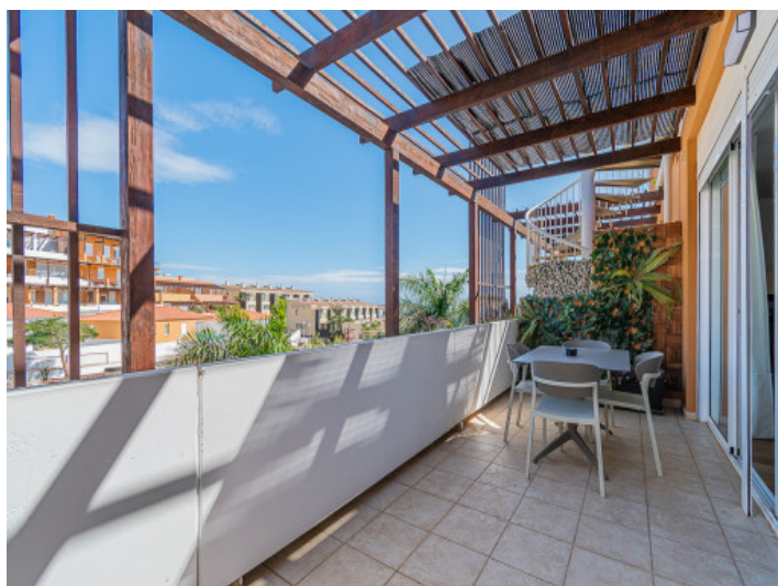
Terrace with outdoor dining area