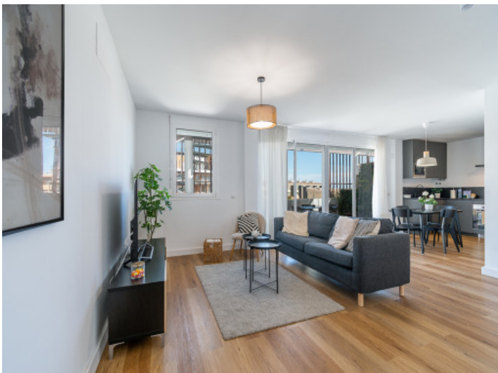
Lovely living area