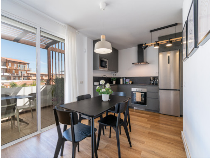
Bright dining area