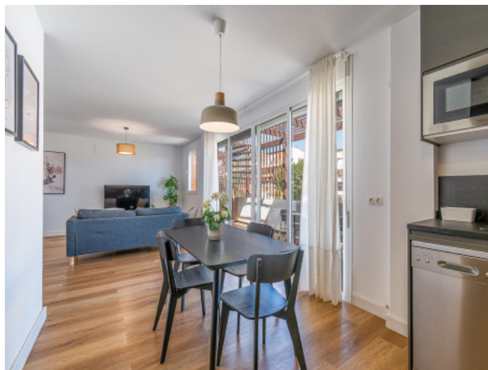
Dining area adjacent to the kitchen