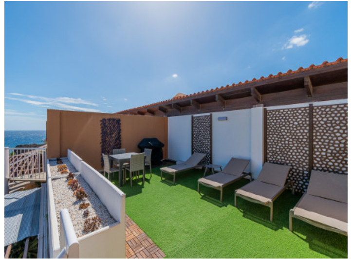
Fantastic roof terrace