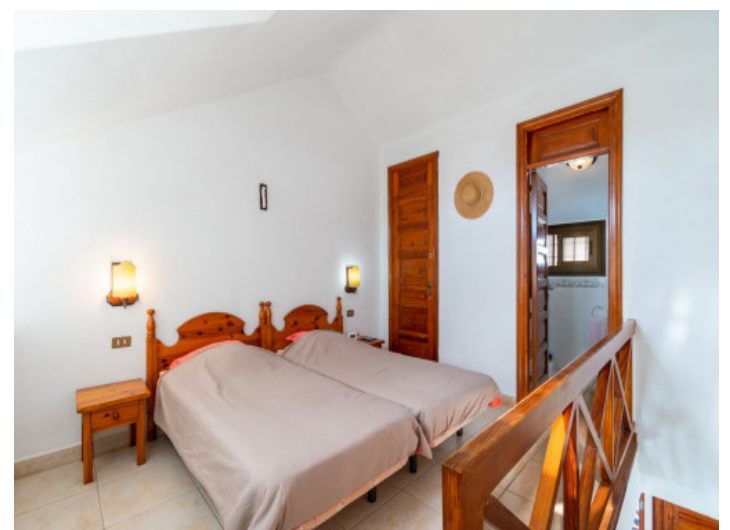
Bedroom with bathroom en suite