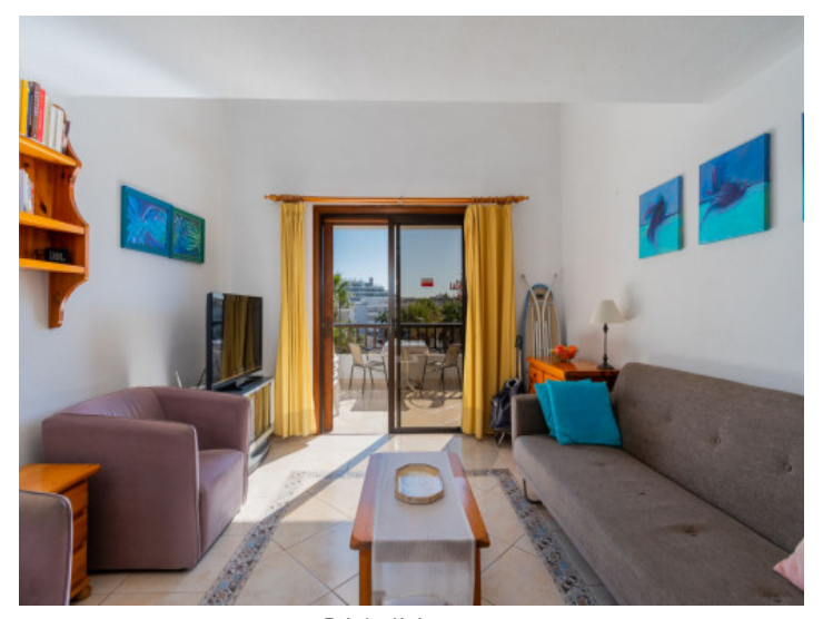
Bright living area