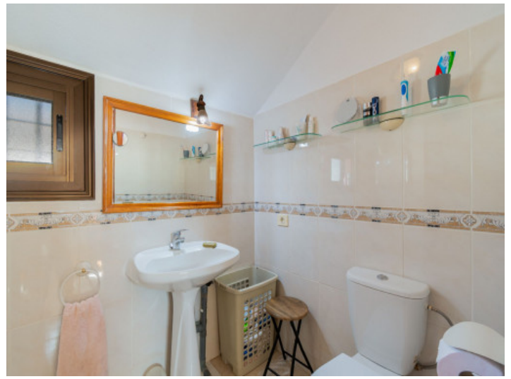
Bathroom en suite

All information is correct to the best of our knowledge. Errors and prior sale excepted. This prospectus is purely for information purposes. Only the notarized deed of sale is legally binding.