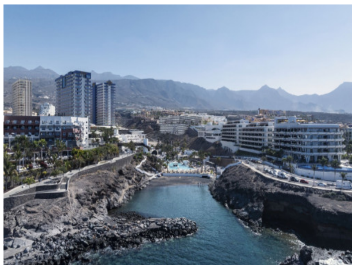
Close to the beach