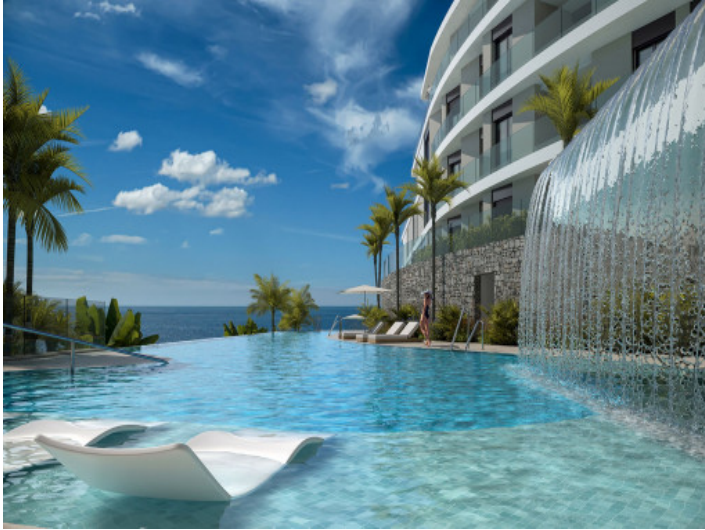
New luxury beachfront apartment in the privileged area of Rokabella,