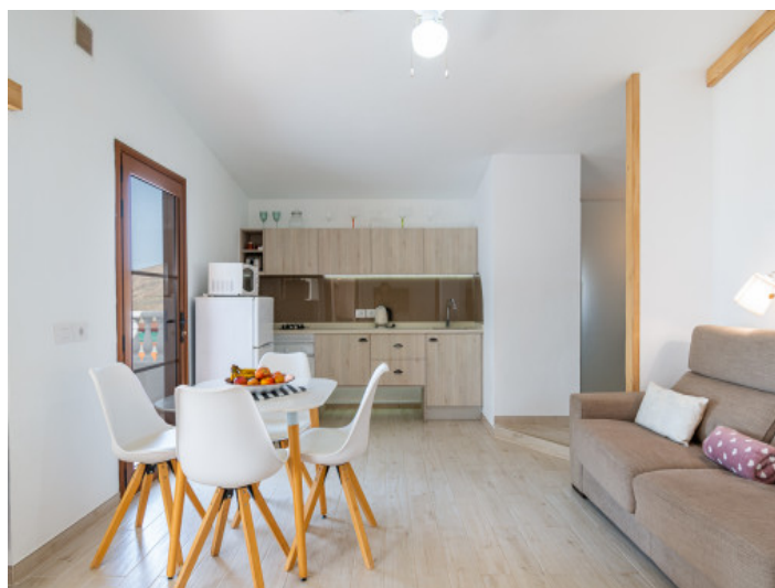
One of 4 holiday apartments