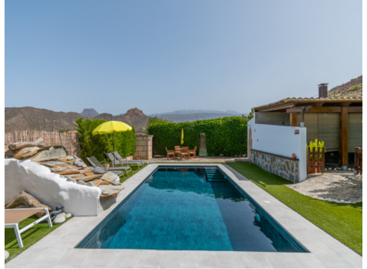
Well mantained pool area