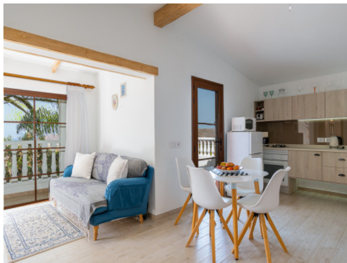
Apartment with open plan kitchen