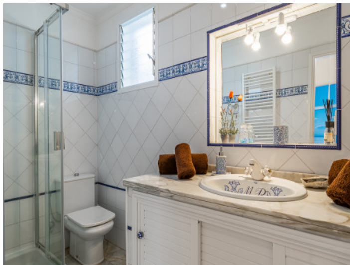
Bathroom with shower