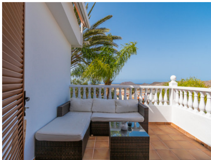
Beautiful private terrace