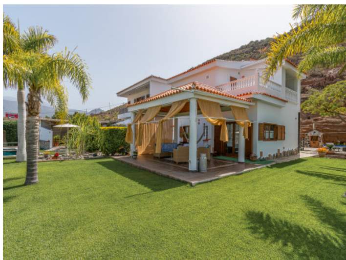
Elegant main house