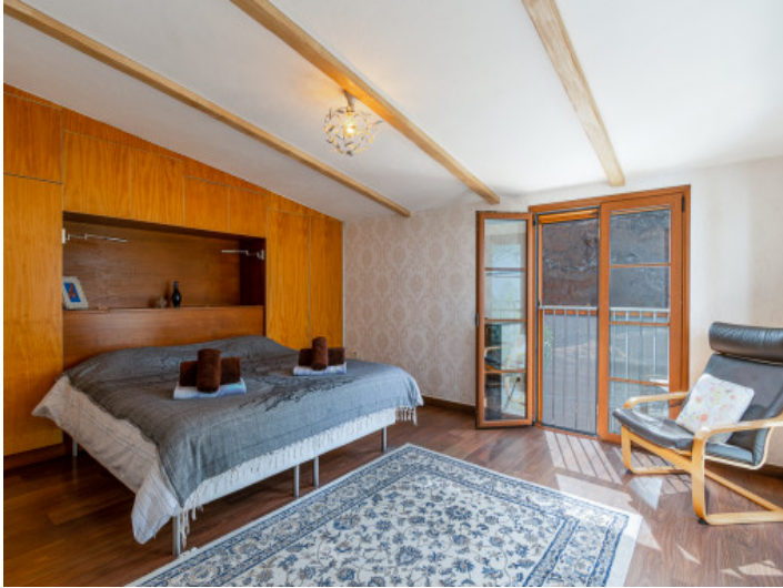
Comfortable holiday destination