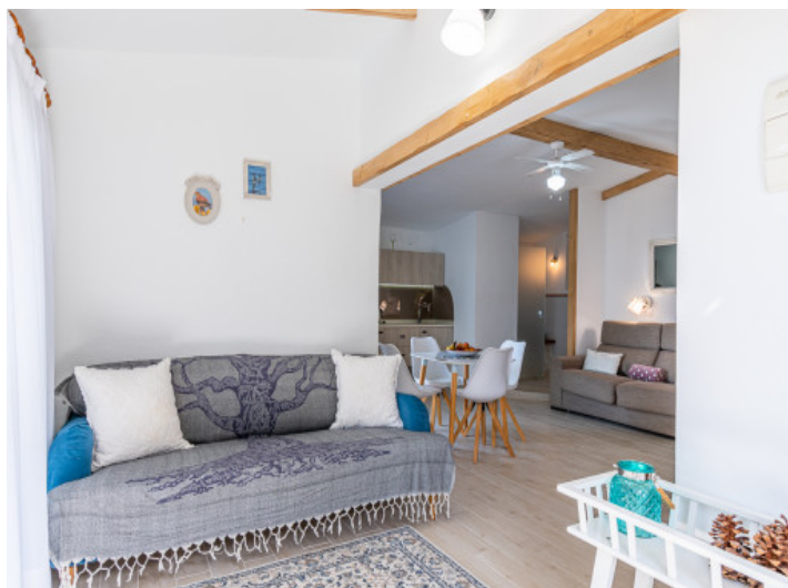
Open plan apartment