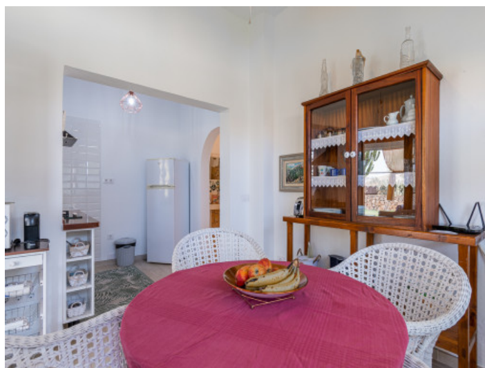
Comfortable living area in one of 4 apartments