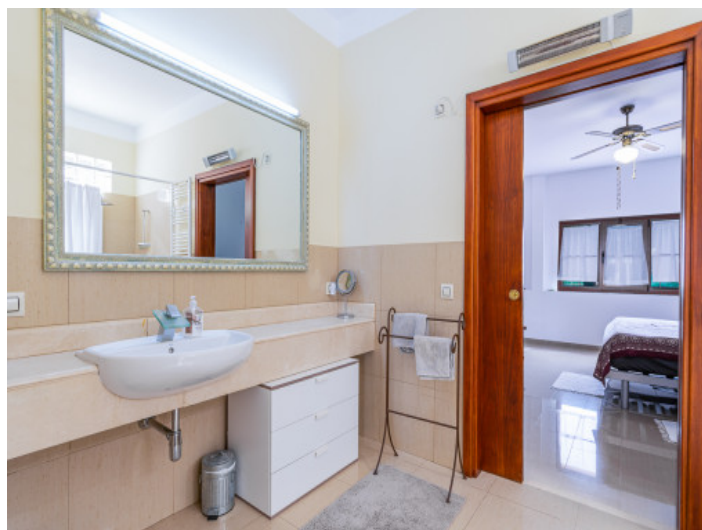
Bathroom en suite

All information is correct to the best of our knowledge. Errors and prior sale excepted. This prospectus is purely for information purposes. Only the notarized deed of sale is legally binding.