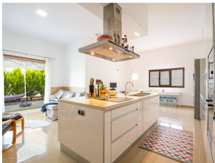
Beautiful kitchen in one of the 4 apartments