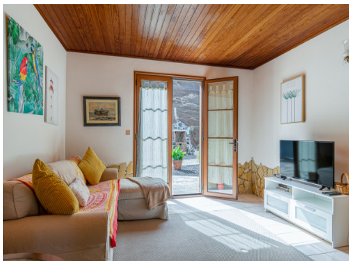
Cozy living room