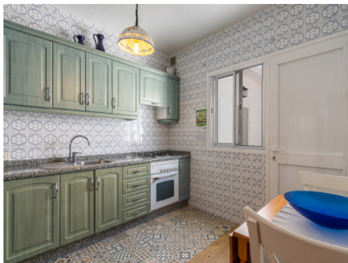
Nice equipped kitchen in one of 4 apartments

All information is correct to the best of our knowledge. Errors and prior sale excepted. This prospectus is purely for information purposes. Only the notarized deed of sale is legally binding.