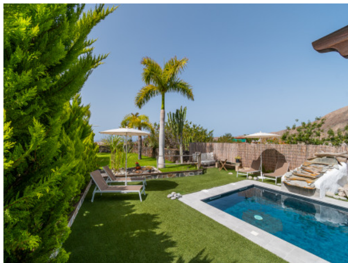
Relax with sea and mountain views