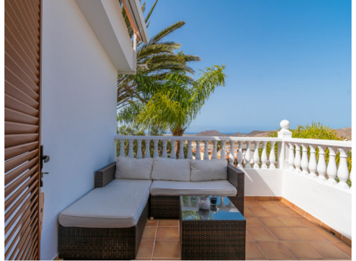
Beautiful private terrace