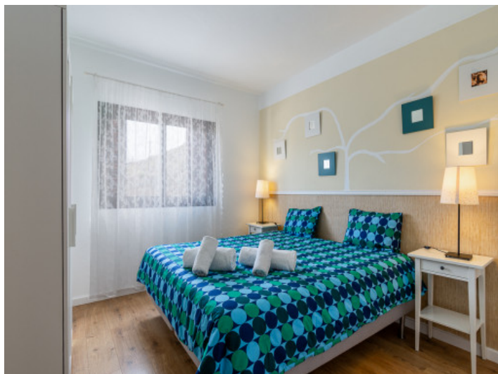
One bedroom of 10 bedrooms