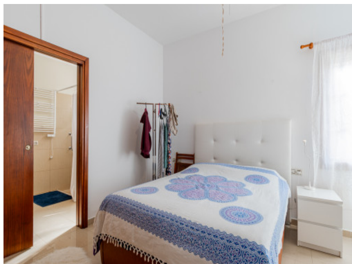
Bedroom with bathroom en suite

All information is correct to the best of our knowledge. Errors and prior sale excepted. This prospectus is purely for information purposes. Only the notarized deed of sale is legally binding.