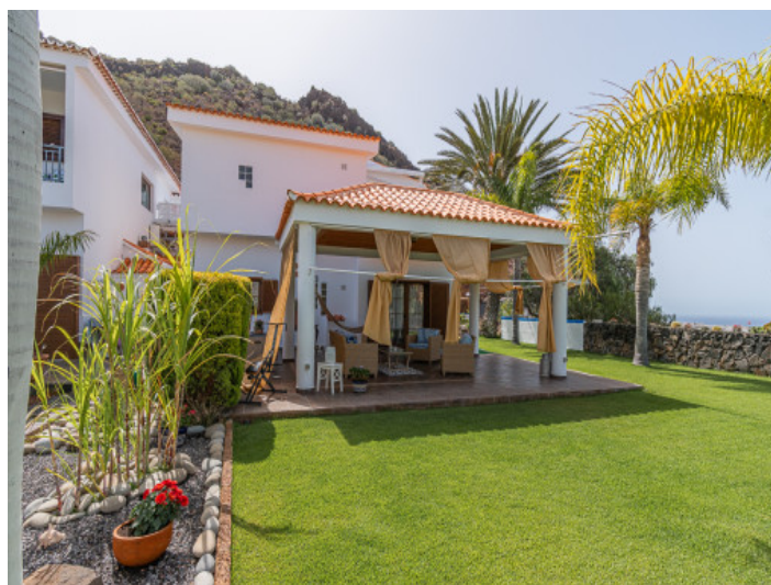
Main house surrounded by a tropical garden