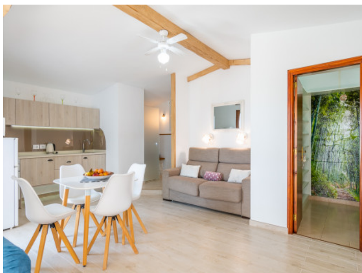
4 apartments are rented the whole year