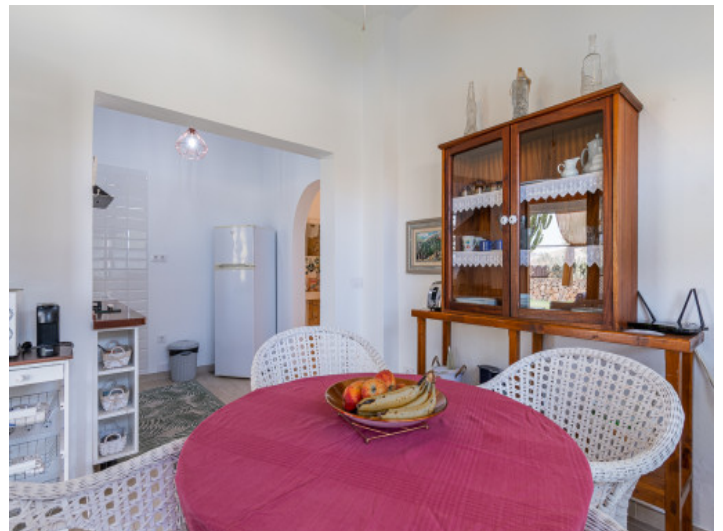
Comfortable living area in one of 4 apartments