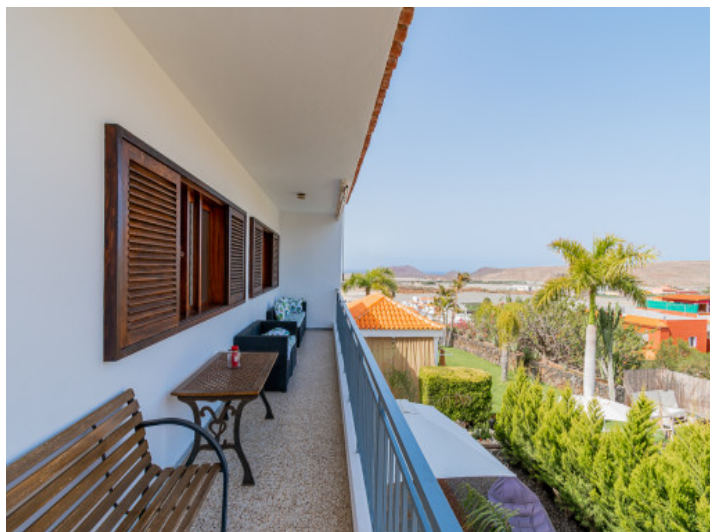
Large balcony with views