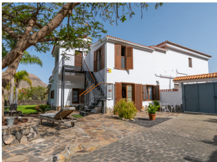
Lovely facade of the anex building