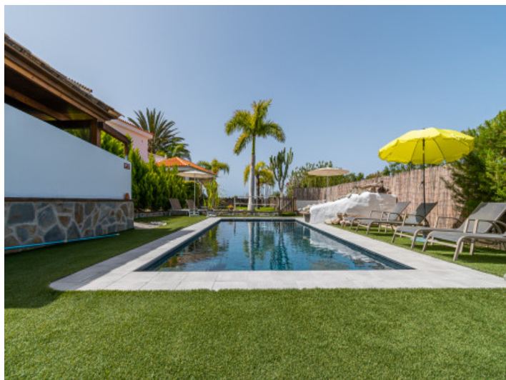
Heated saltwater pool