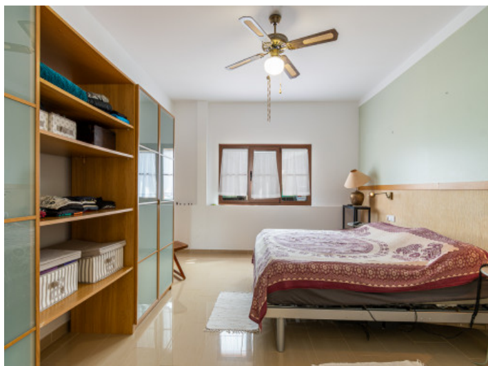
Bedroom with ventilator