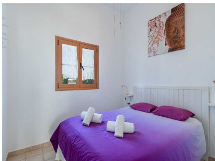
Welcome your guests the whole year round