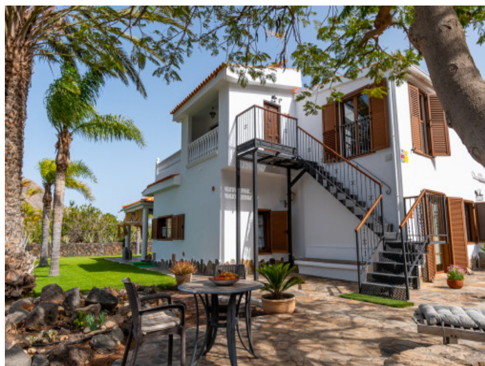
Finca with outdoor parking spaces

All information is correct to the best of our knowledge. Errors and prior sale excepted. This prospectus is purely for information purposes. Only the notarized deed of sale is legally binding.