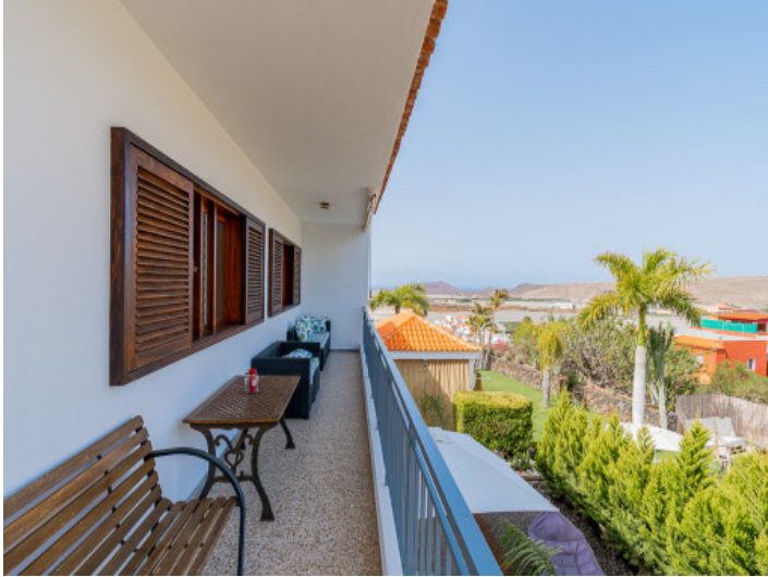
Large balcony with views