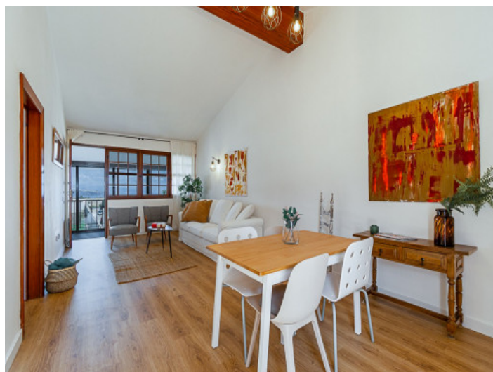
Living area and dining area

All information is correct to the best of our knowledge. Errors and prior sale excepted. This prospectus is purely for information purposes. Only the notarized deed of sale is legally binding.