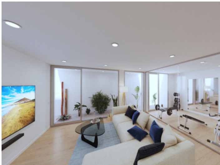
Living area and gym