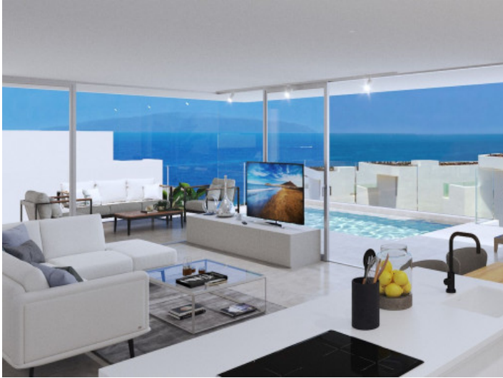
Living area and kitchen