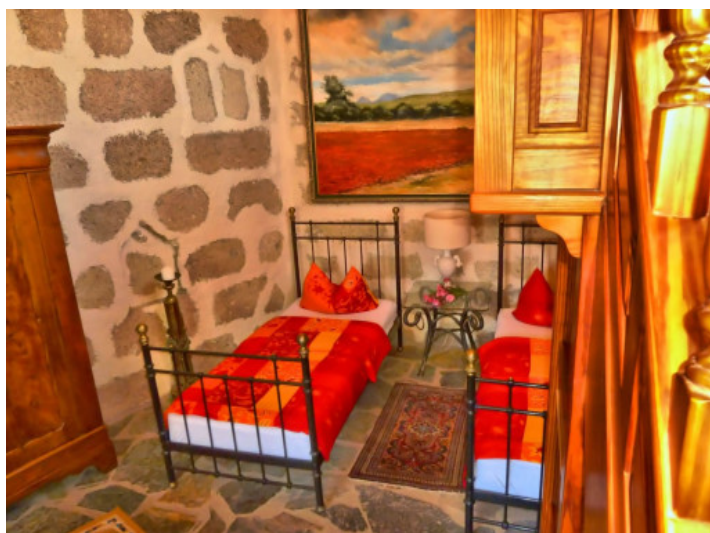
Bedroom Casa Sir