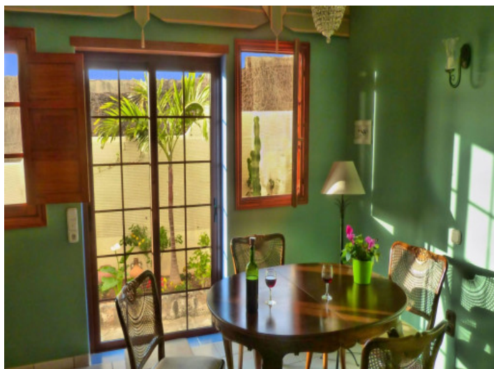
Living area Casa Alexandra