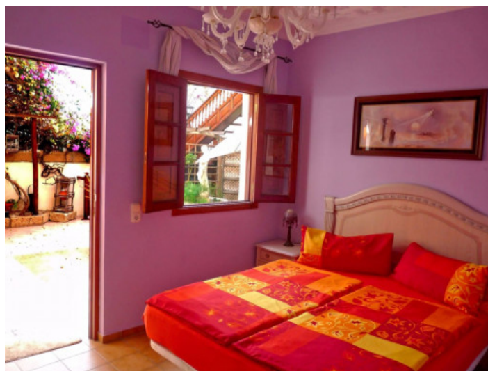
Bedroom Casa Alejandra