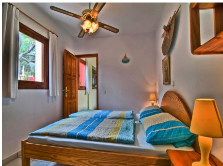
Bedroom Casa Cleopatra