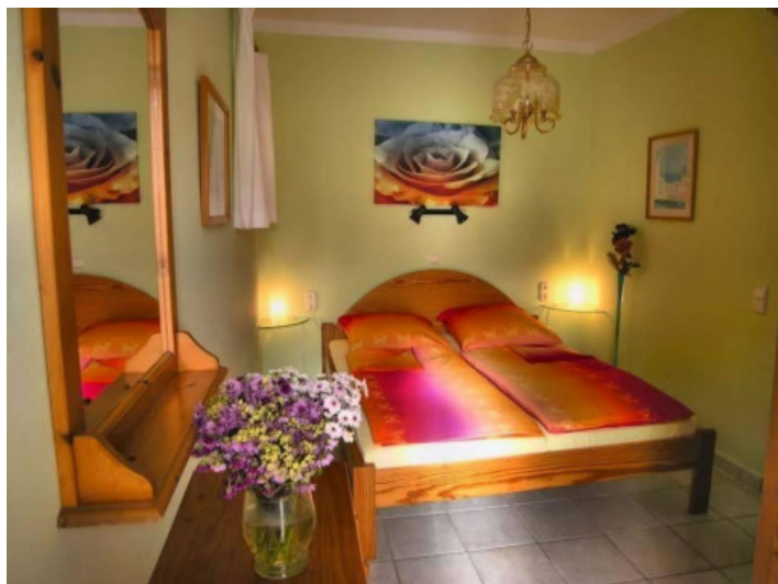
Bedroom Casa Cesar