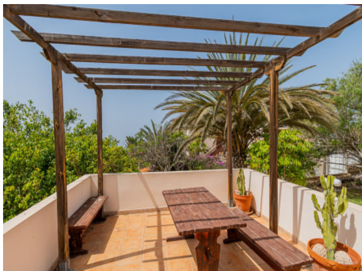
Rooftop Casa Cesar