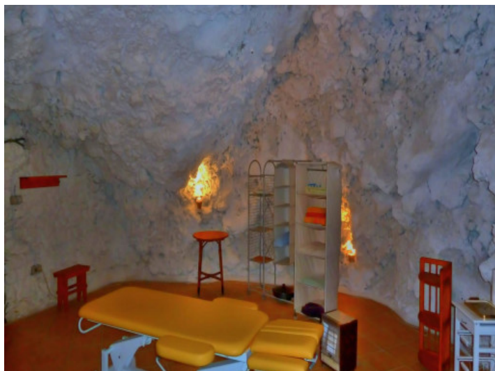
Dining area in the cave