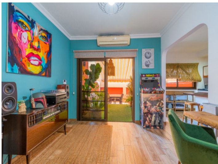
Direct access to the patio