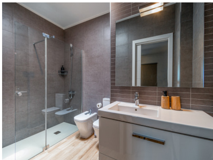
There are a total of 2 bathrooms

All information is correct to the best of our knowledge. Errors and prior sale excepted. This prospectus is purely for information purposes. Only the notarized deed of sale is legally binding.