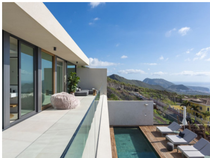
Balcony and terrace