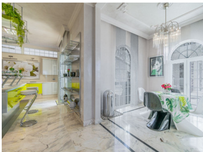
Breakfast area in the kitchen