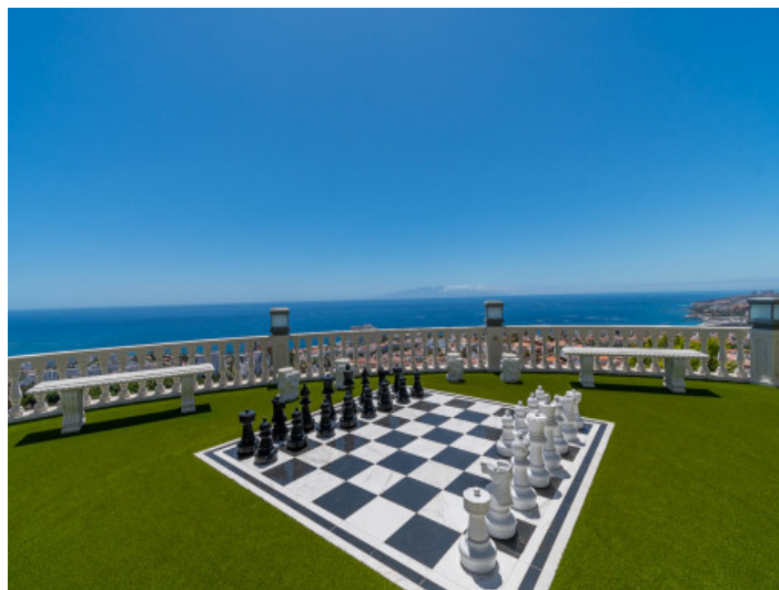
Amazing sea views