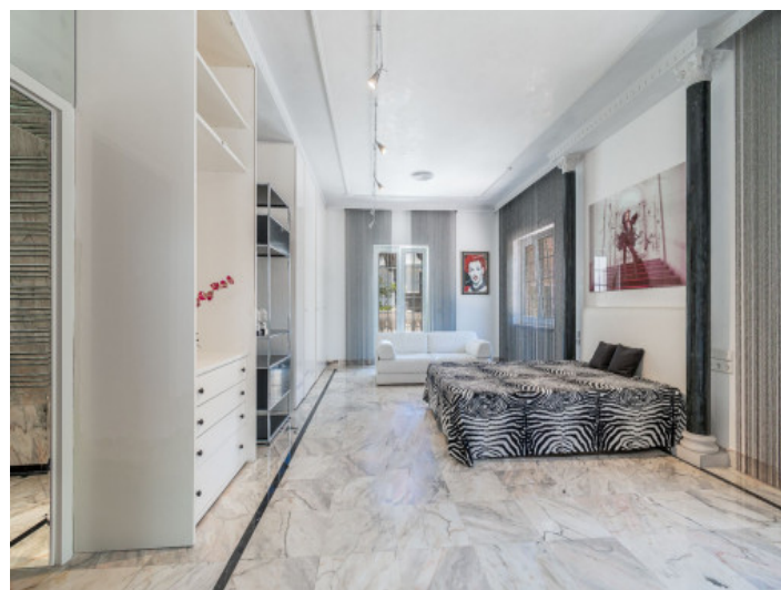
Five elegant bedrooms