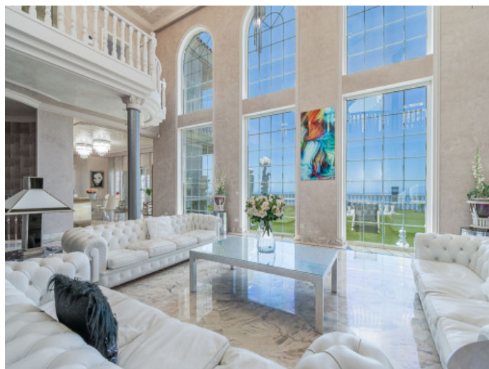
Living area with sea and garden views

All information is correct to the best of our knowledge. Errors and prior sale excepted. This prospectus is purely for information purposes. Only the notarized deed of sale is legally binding.