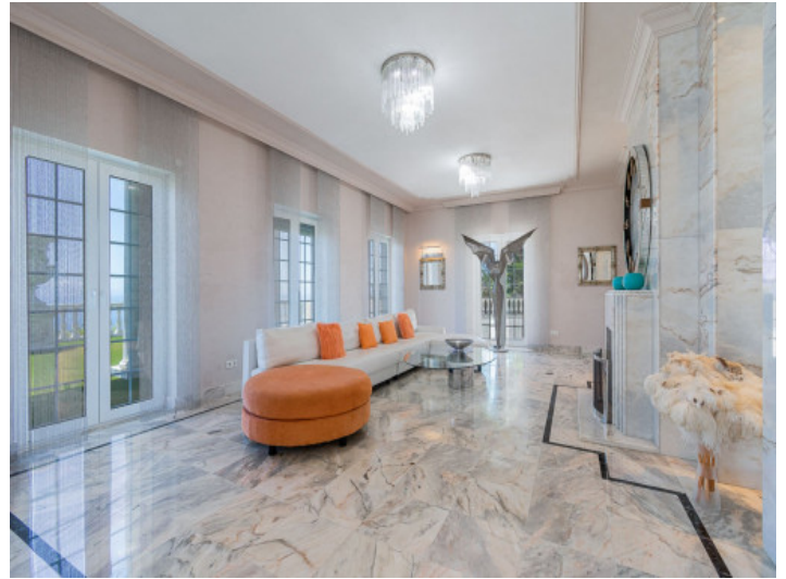
Second living area with fireplace