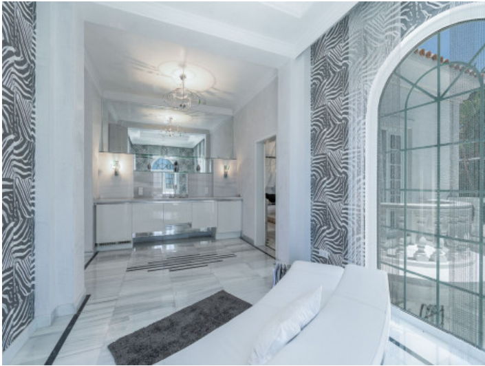
Villa with 8 bathrooms