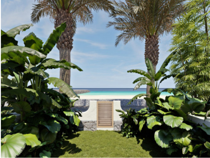
Direct beach access