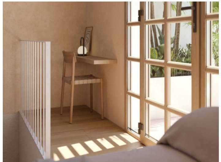
Bedroom with study area