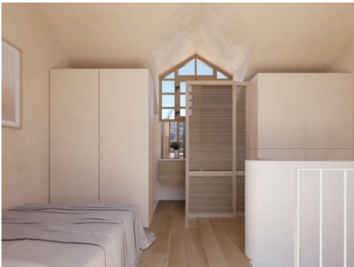
Bedroom with en suite bathroom