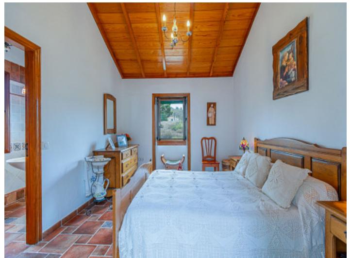
One of 2 bedrooms