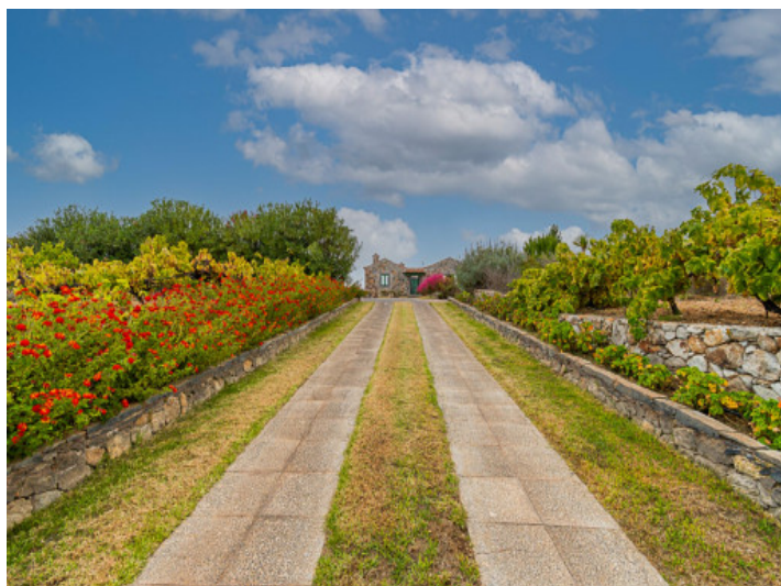
Way to the finca

All information is correct to the best of our knowledge. Errors and prior sale excepted. This prospectus is purely for information purposes. Only the notarized deed of sale is legally binding.