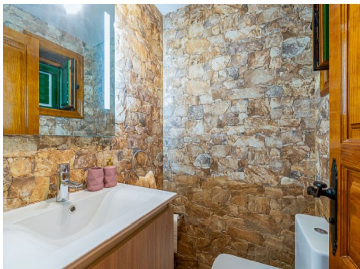
House with 3 bathrooms