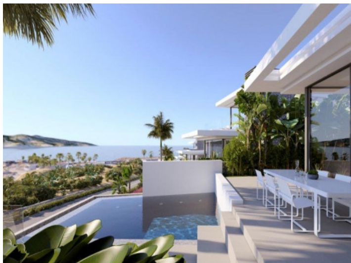
Fantastic sea views