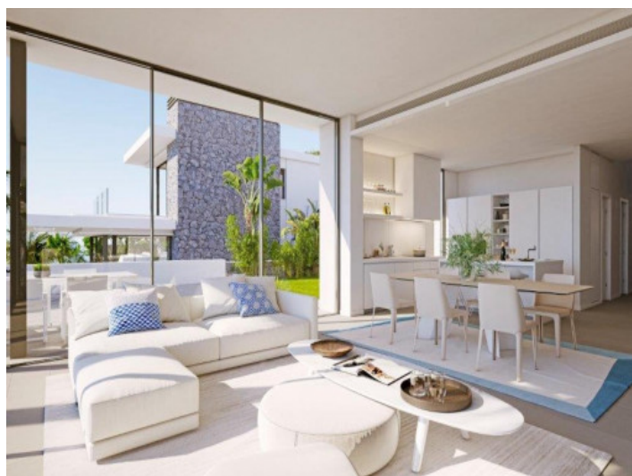
Open plan living and dining area