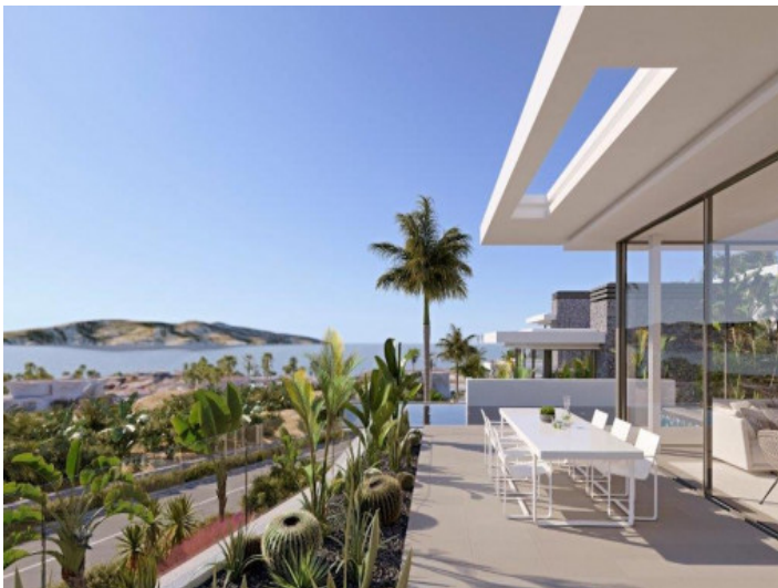
Sunny terrace with outdoor dining area