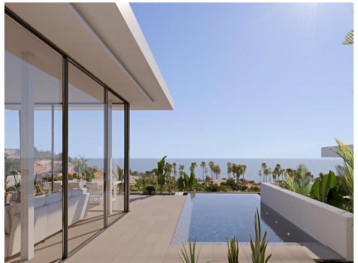
Large terrace with sweeping views