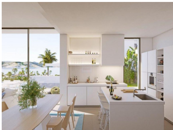
Modern kitchen with island

All information is correct to the best of our knowledge. Errors and prior sale excepted. This prospectus is purely for information purposes. Only the notarized deed of sale is legally binding.