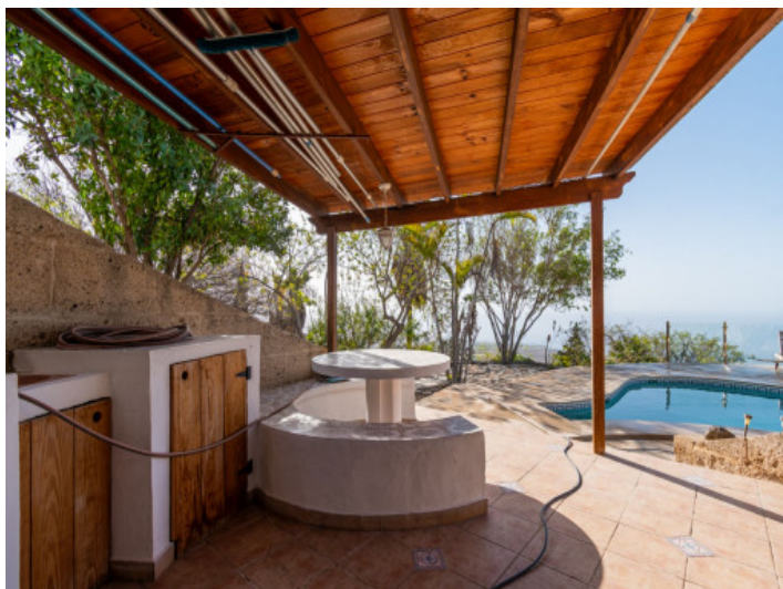
Terrace and sea views