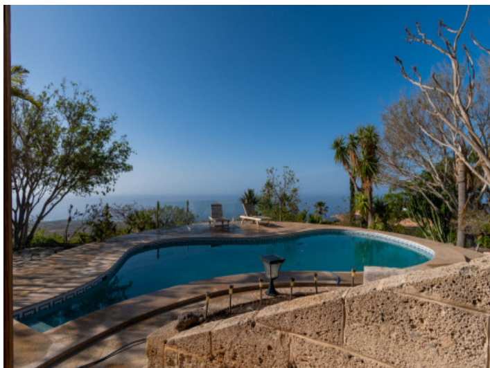
Pool and sea views