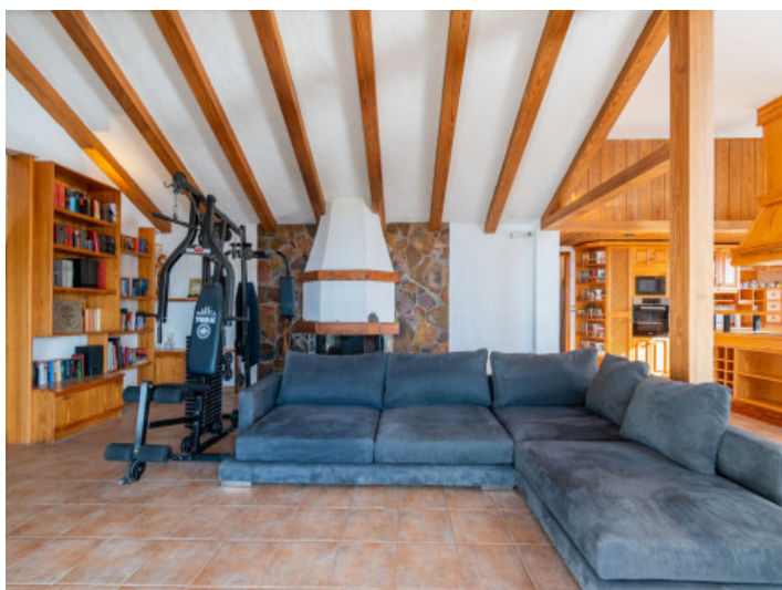
Large living area