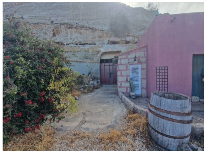
House on the plot

All information is correct to the best of our knowledge. Errors and prior sale excepted. This prospectus is purely for information purposes. Only the notarized deed of sale is legally binding.