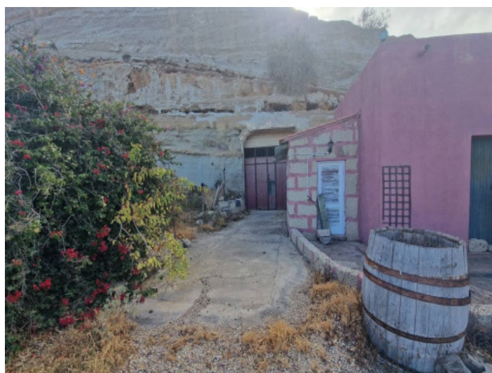
House on the plot

All information is correct to the best of our knowledge. Errors and prior sale excepted. This prospectus is purely for information purposes. Only the notarized deed of sale is legally binding.