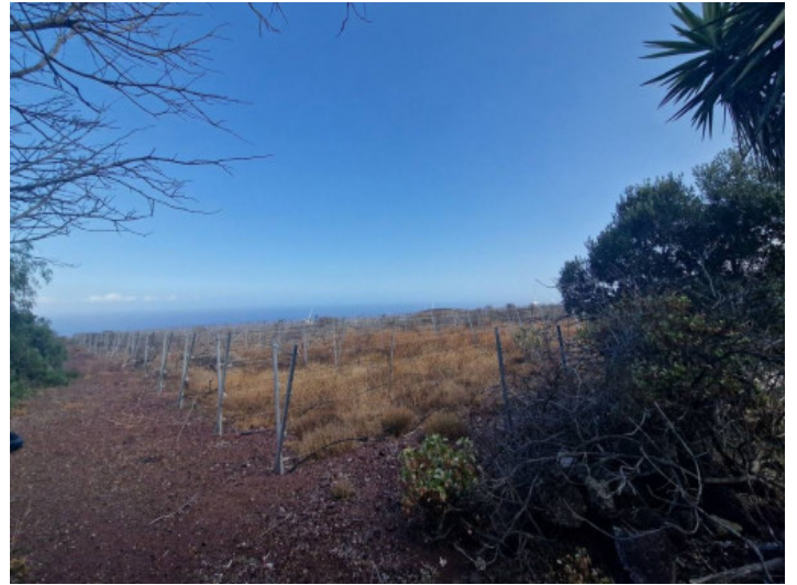
Plot with a lot of potencial