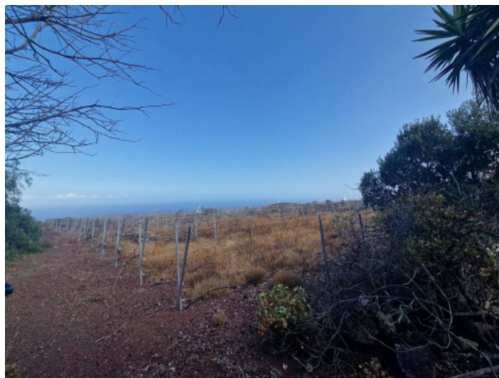
Plot with a lot of potential