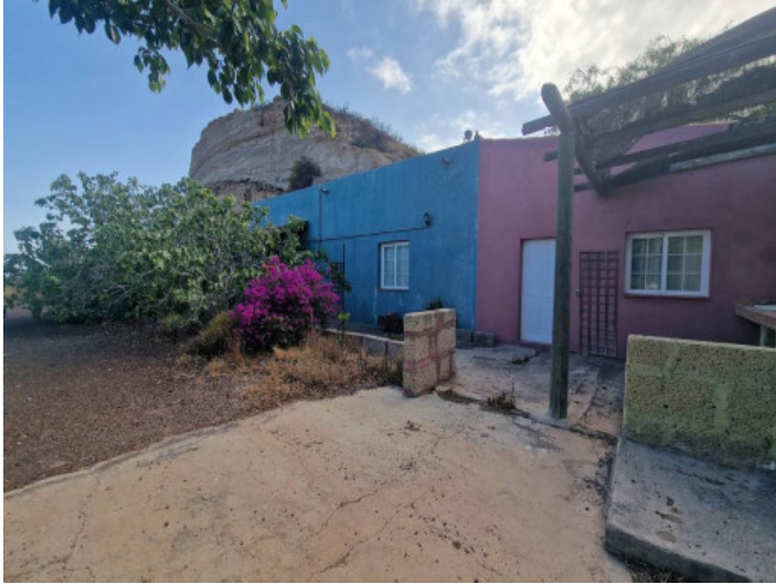
Views to the house