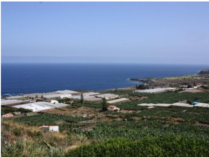
Sea-views from the finca