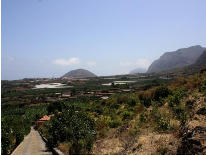
Acces to the plantatin