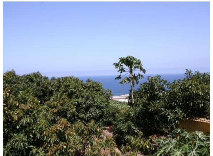
Another perspective from the finca

All information is correct to the best of our knowledge. Errors and prior sale excepted. This prospectus is purely for information purposes. Only the notarized deed of sale is legally binding.