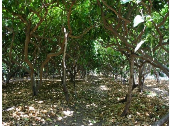
"4 Seasons" Lemon grove